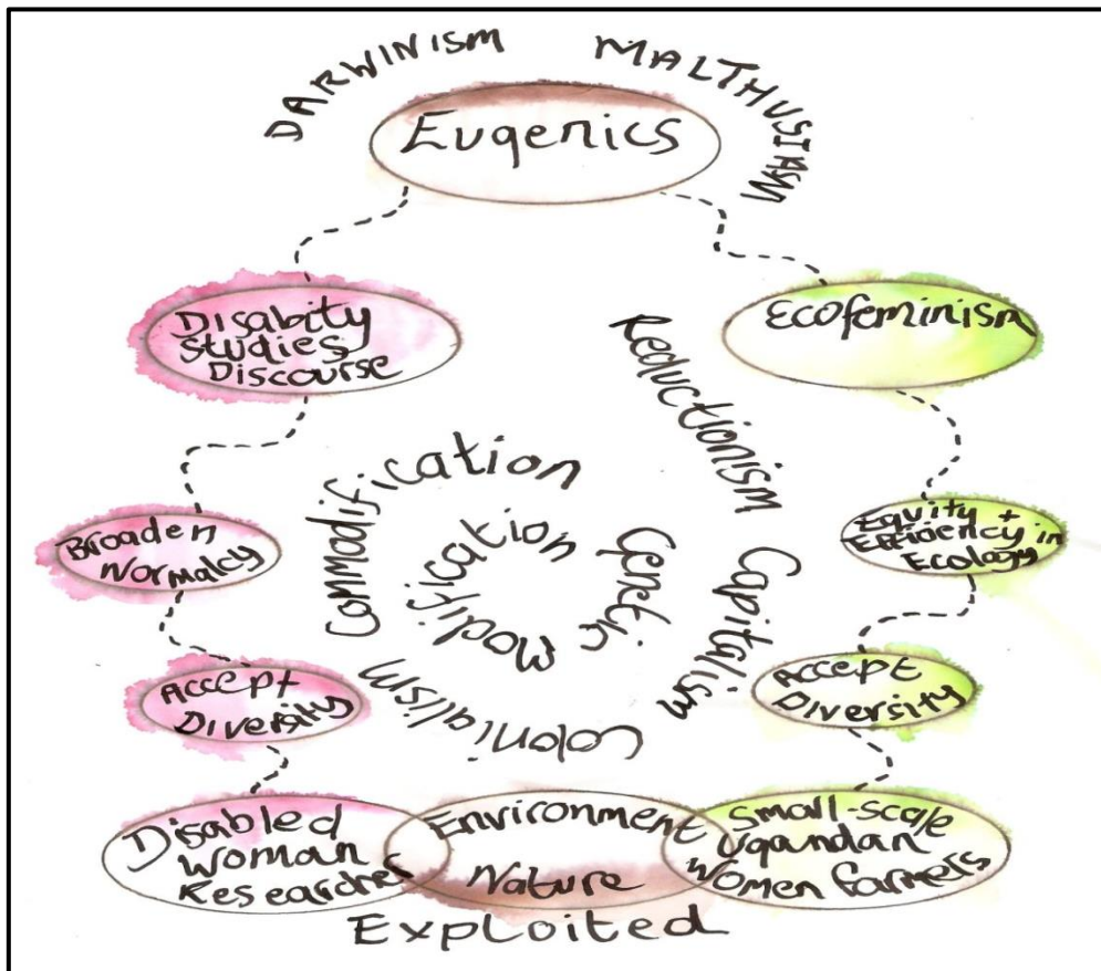
Figure 2 above is a diagram illustrating the mind map of the theoretical framework including a researcher with a disability, farmers participating in the study and the physical environment on which farming depends. It demonstrates the relationship of ecofeminist and disability studies dialogues as a rejection of the Eugenics movement.

Agriculture programs delivered by the state and NGOs, as well as farmers, purchase TC banana plants from agricultural outlets such as AGT Laboratories that are supported by the Rockefeller Foundation, amongst other international organisations. The farmer is commodified by pressure to purchase additional inputs from the agricultural outlets every growing season and encouraged into mono-cropping or intensive cultivation of one crop variety. Sovereignty of the semi-subsistence farmer of banana biodiversity is reduced due to the potential reliance upon a limited amount of cultivars by participating in agricultural development programs supported by such institutions (Leadbeater, 2011).